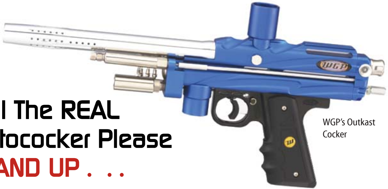
WGP's Outkast Cocker