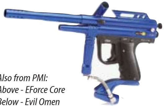
Also from PMI: Above - EForce Core Below - Evil Omen