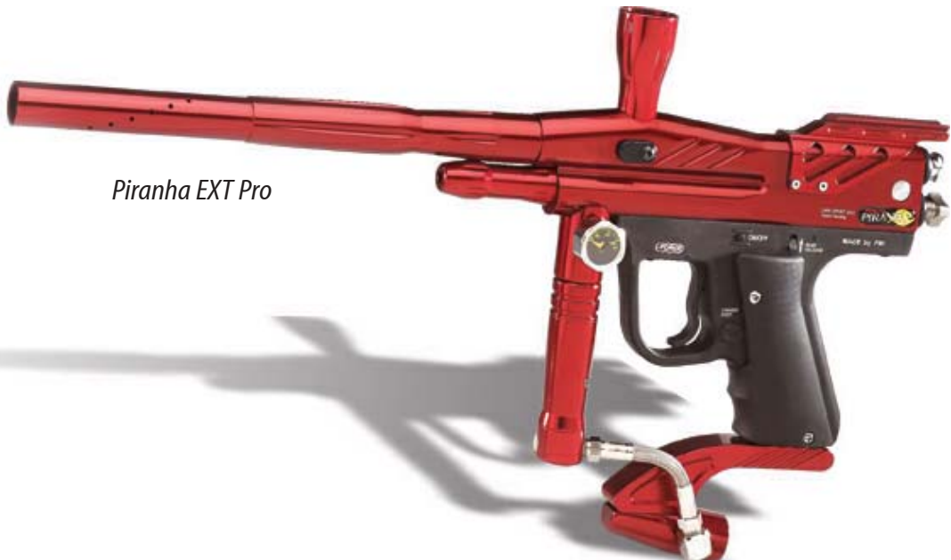
Piranha EXT Pro